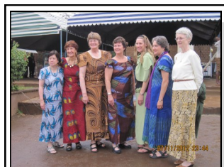
The girls show off their dresses made in Moshi.

1. People should wear modest clothing that also protects from mosquito bites. Long skirts are appropriate for women. Men may want to bring a sport coat or cardigan sweater for more formal occasions such as the ordination celebrations.